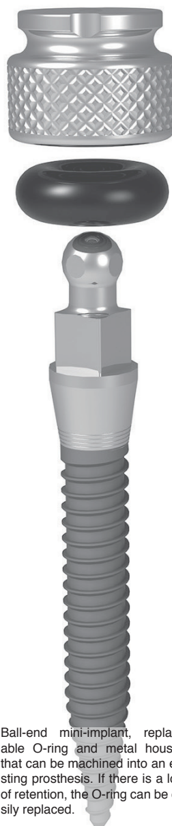
Ball-end mini-implant, replaceable O-ring and metal housing that can be machined into an existing prosthesis. If there is a loss of retention, the O-ring can be easily replaced.

One solution is the insertion of at least two conventional implants for prosthesis anchoring. Studies show that this results in a significantly improved quality of life compared to the conventional, purely mucosal-supported prosthesis [5-6]. For older patients, however, this form of therapy is