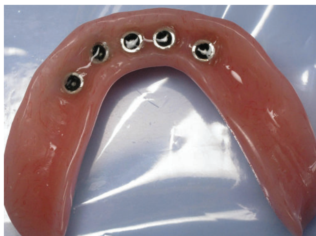
Fig. 9: Final retentive housing secured into lower denture