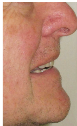
Fig. 11: Patient full face with proper lip support and correct VDO