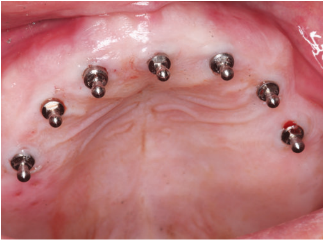
Fig. 2: Immediate condition after mini dental implant insertion

Palpation and radiographic examination revealed a moderately narrowed maxillary and mandibular ridge. Because of this, it was important to utilize small diameter implants so that there was at least 1 mm of bone on the buccal and lingual sides of the implants.