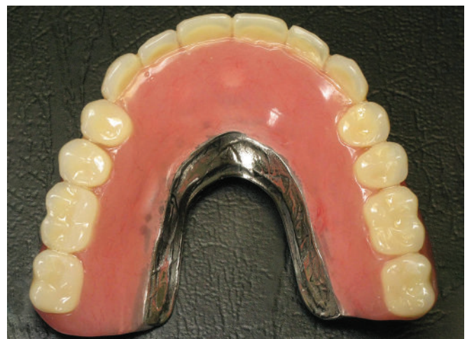
Fig. 5: Final cast metal reinforced upper overdenture