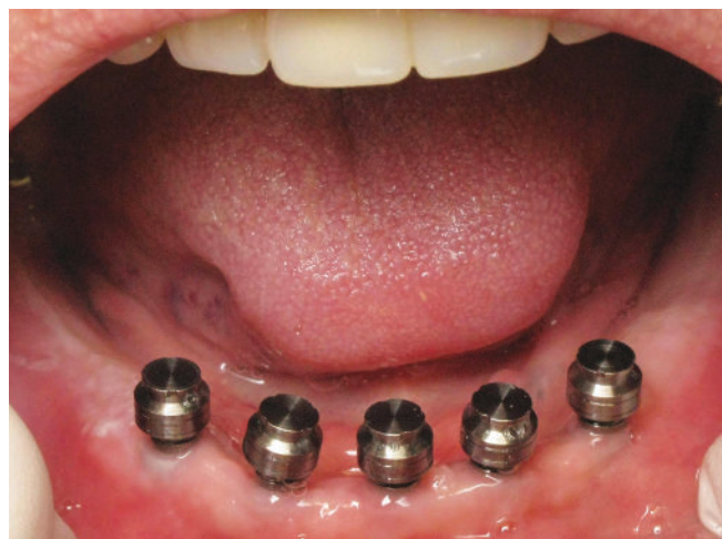
Fig. 7: Mandibular ridge with mini implant retentive housings