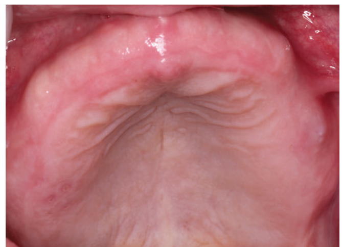
Fig. 1: Preoperative condition maxillary residual ridge

A man in his late sixties presented to our office frustrated with his upper and lower complete dentures. He complained that his upper denture was nonretentive and nonfunctional, always falling out during speech or eating. His use of moderate amounts of adhesive to keep the prosthesis retained would gag him severely. He reported similar complaints with his lower denture as well (Fig. 1).