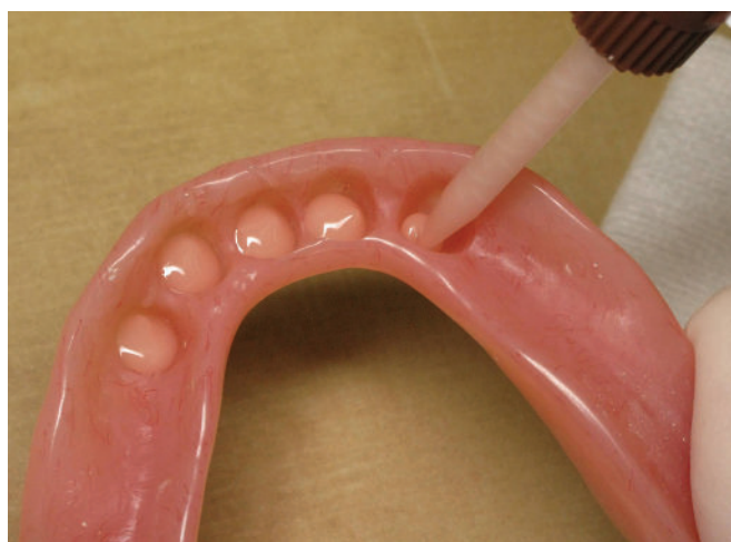
Fig. 8: Chairside pickup material injected into lower denture