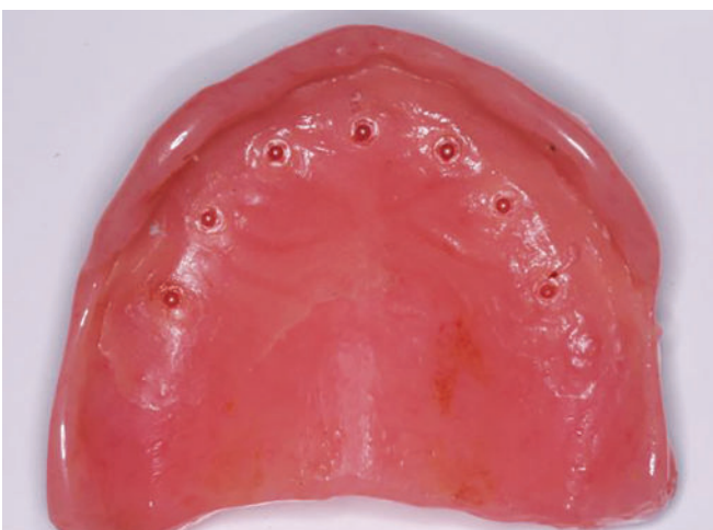
Fig. 4: Soft lined upper full denture

Once the implants were placed, the denture was relieved to allow full seating of the denture with no rocking on the implants. A soft liner was placed and impressions taken to fabricate a metal-reinforced horseshoe-shaped denture (Figs 4 and 5). Once the new metal frame was returned from the lab, the traditional steps to fabricating a complete denture were followed. After the final wax setup was approved, the denture was finalized. The undercut below the O-balls were blocked out. The cleaned and dried recesses that were created in the denture were filled with self-cure acrylic and seated onto the implants and allowed to polymerize. Upon setting, the denture was relieved of any excess flash and any voids were filled in with pink composite (Figs 6 and 7). The patient was very pleased with the fit, function, and esthetics of the new denture. This same process was repeated on the lower arch with five mini dental implants (Figs 7 to 9).