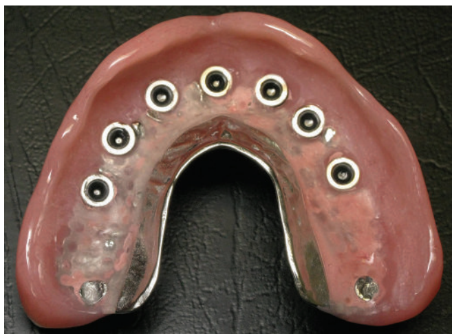
Fig. 6: Final cast metal overdenture with retentive housing inserted

ridge augmentation. The advent of the mini dental implant has given general dentists an easy, less costly, and rapid way of solving many of the difficult problems that arise in dental practice with complete dentures (Figs 10 and 11).