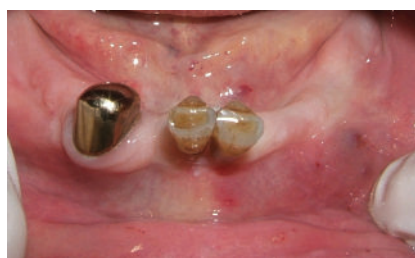
Figure 1: Initial situation, before surgery