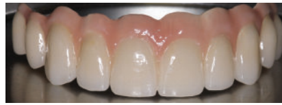
Figure 7: 10-unit bridge