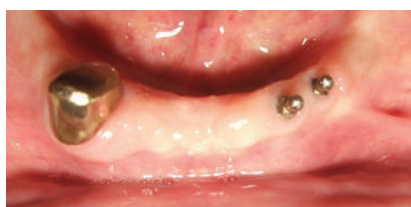
Figure 5: 2-year clinical re-evaluation