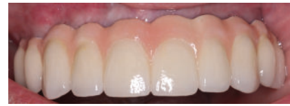
Figure 8: Mini implant bridge 1 month post-op

with a Water Pik® and toothbrush. Upon removal of the modified denture, the oral cavity, implants, and prosthesis were free of debris. With this information, a treatment plan was formulated to place an additional three mini implants to support a 10-unit fixed partial denture 10-unit FPD (Evolution Dental Lab) (Figure 5).