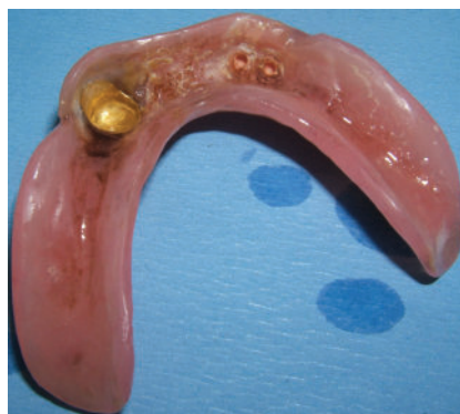
Figure 4: Prosthetic re-evaluation after 2 years