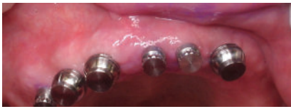
Figure 6: OCO Mini® implants with retentive housings