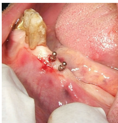
Figure 2: Mini implants placed, no bleeding